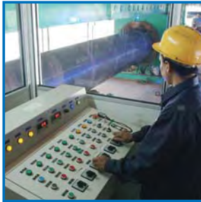
5. Hydrostatic Testing & End Forming