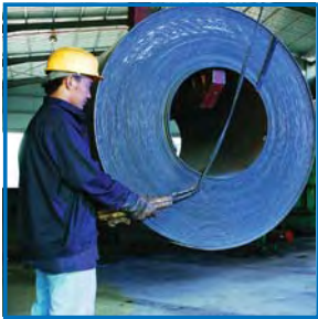
1. Steel Coil Receiving

It is a matter of pride that we at Pipetec emphasise on quality at each and every step of our manufacturing process. Besides using the best quality raw material, strict quality control measures are taken throughout each process to ensure all products are free from defect and meet international standards in terms of quality, design and finish.