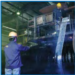
9. External Bitumen Coating