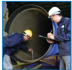
10. Internal Concrete Lining

Note: The steel pipes is to be manufactured in accordance with BS 534 & BS 3601 Pipes of sizes and dimension can be manufactured upon request