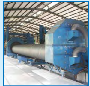
7. Internal Blasting