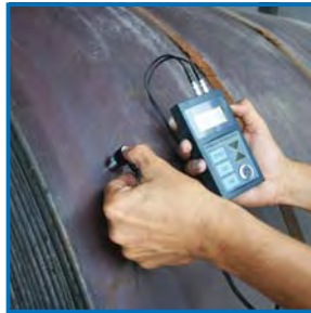
2. Ultrasonic Thickness Checking