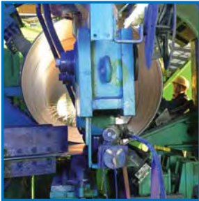
4. Spiral Pipe Forming