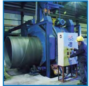
6. External Blasting